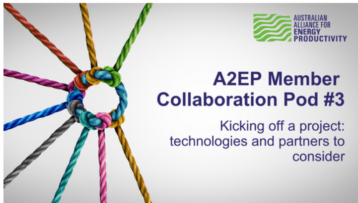
Exclusive access to Member briefings