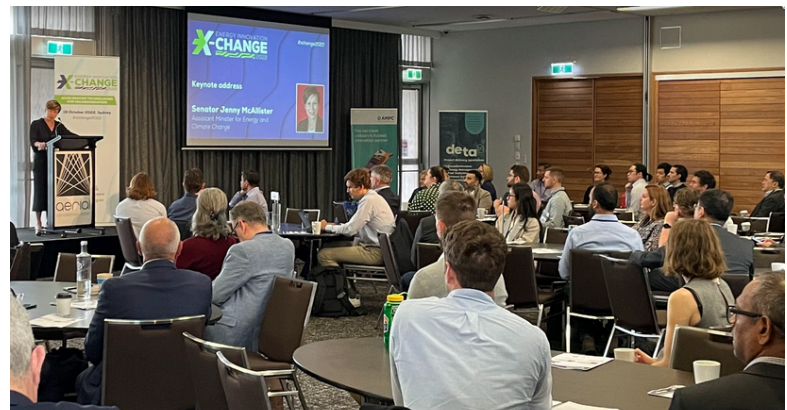
Discounted access to A2EP and industry events