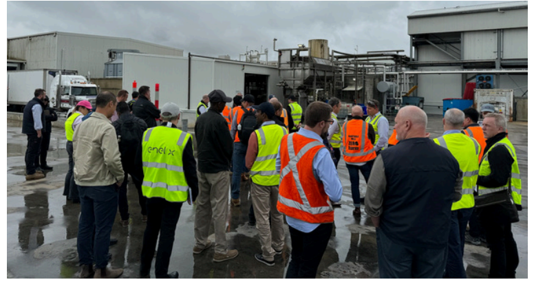
Discounted access to site tours