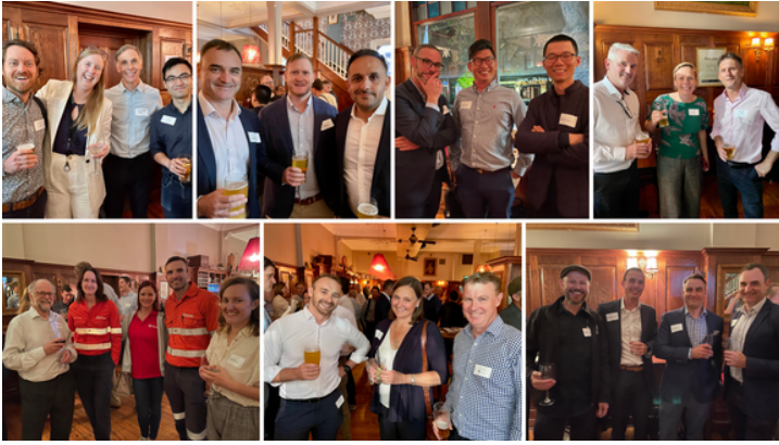
Exclusive Member updates & networking drinks