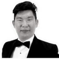
Chun Hui Goh Energy Smart Water